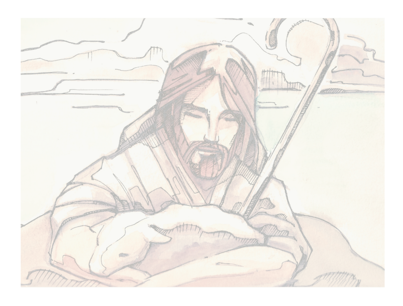
He Restores my Soul | Drawing Closer to Jesus in Psalm 23

The LORD is my shepherd; I shall not want. He makes me lie down in green pastures. He leads me beside still waters. He restores my soul. He leads me in paths of righteousness for His name's sake. Even though I walk through the valley of the shadow of death, I will fear no evil, for You are with me; Your rod and Your staff, they comfort me. You prepare a table before me in the presence of my enemies; You anoint my head with oil; my cup overflows. Surely goodness and mercy shall follow me all the days of my life, and I shall dwell in the house of the Lord forever. Psalm 23 ESV